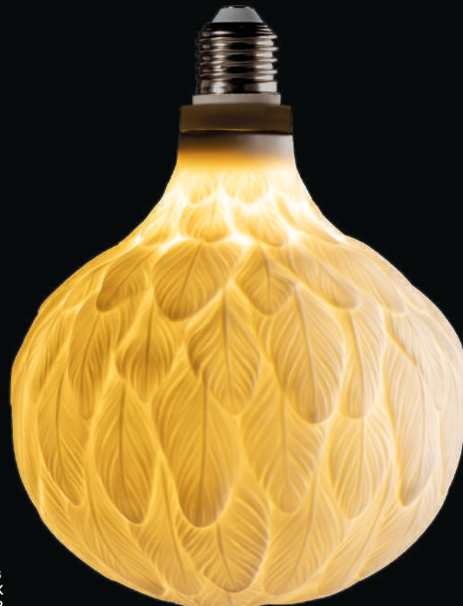
FEATHERS BULB 01024388 CE/UK 01024397 US/JP (E27/E26) 20 x Ø15 cm 7 3/4 x Ø6"

Include non dimmable 3000°K LED bulb and E26/E27 adapter for G9 LED bulb.