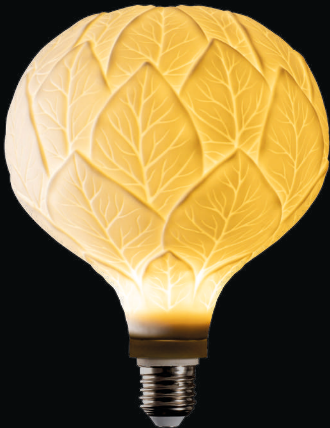
OAK BULB 01024389 CE/UK 01024398 US/JP (E27/E26) 20 x Ø15 cm 7 3/4 x Ø6"

Include non dimmable 3000°K LED bulb and E26/E27 adapter for G9 LED bulb.