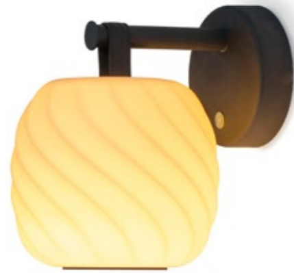
Ice Cream Wall Light 01024132 CE/UK 01024133 US 01024134 JP