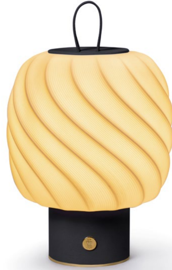
Ice Cream Table lamp Blue · Ice Cream Table Lamp Black