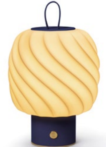
Ice Cream Portable Lamp (M). Blue. 01024022