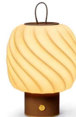
Ice Cream Portable Lamp (M). Leather. 01024049

The Lladró logo button on the base is the dimmer switch to turn the light on and off and to adjust the light.