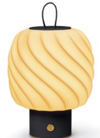
Ice Cream Portable Lamp (M). Black. 01024048