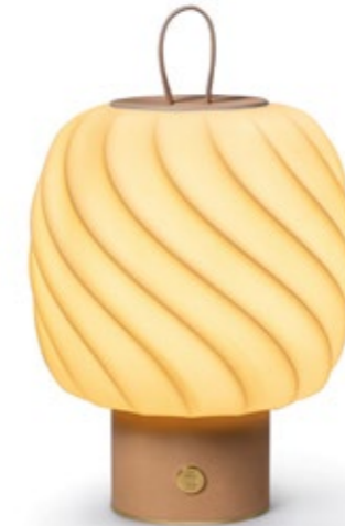
Ice Cream Portable Lamp (M). Nude. 01024021