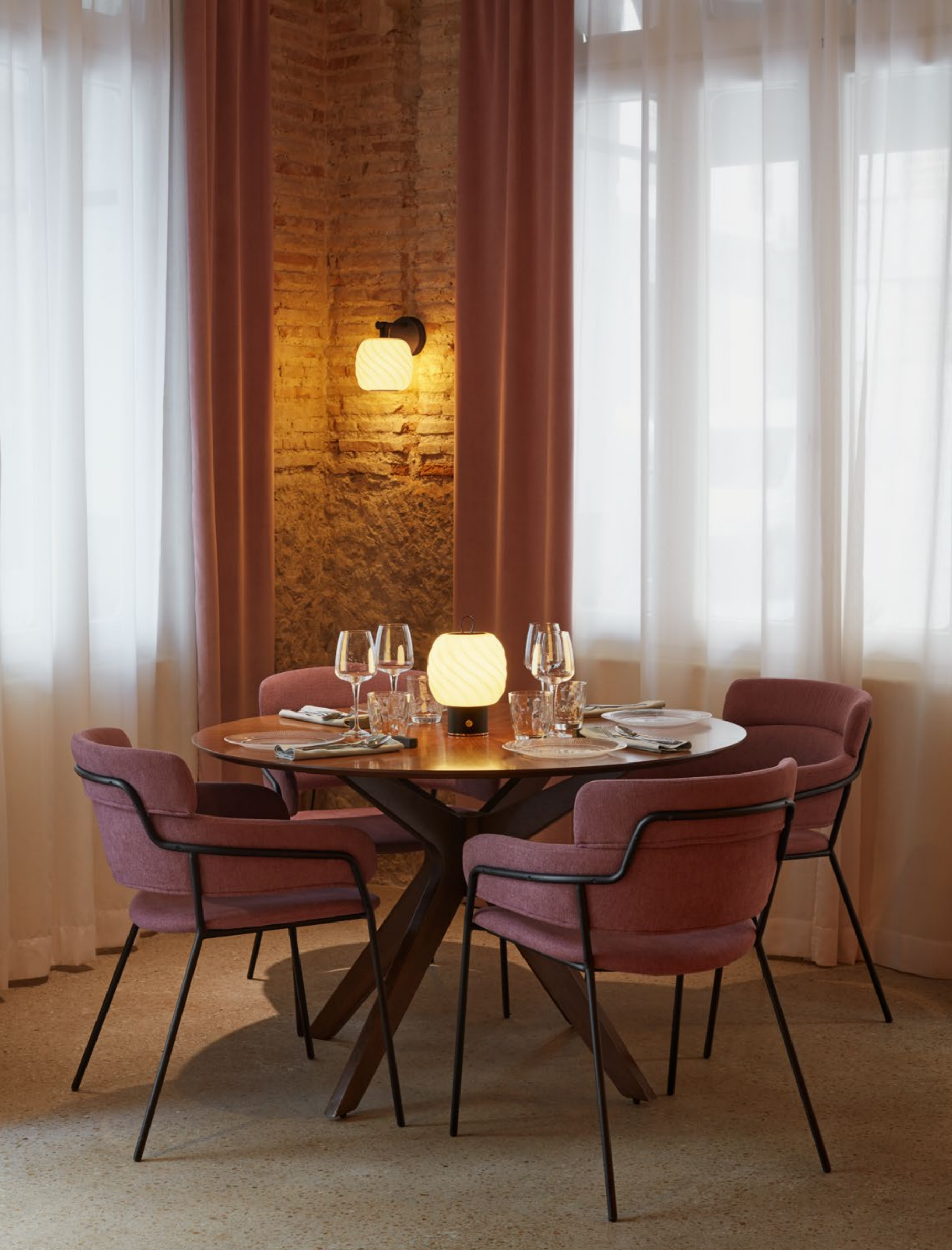
Ice Cream Wall Light - Ice Cream Portable Lamp Black