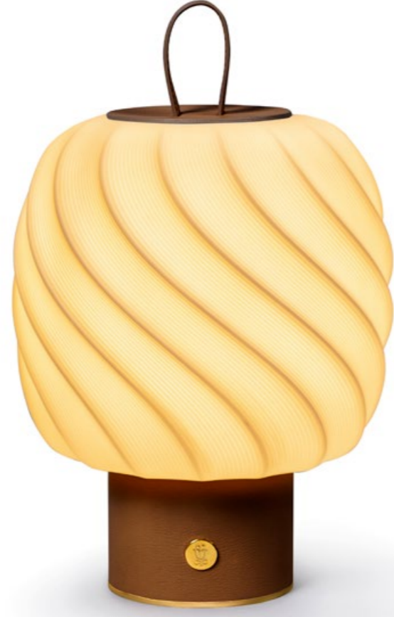
Ice Cream Portable Lamp Nude · Ice Cream Portable Lamp Leather.