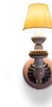
Firefly Wall Light 01024100 CE/UK 01024101 US 01024102 JP