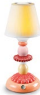
Lotus Firefly lamp (coral) 01023760