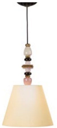
Firefly Hanging Lamp 01023999 CE/UK 01024000 US 01024001 JP