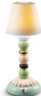
Palm Firefly lamp (golden fall) 01023793