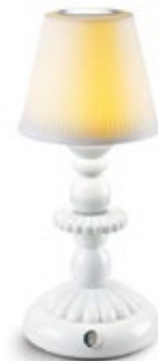
Lotus Firefly lamp (white) 01023759