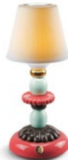
Lotus Firefly lamp (golden fall) 01023792