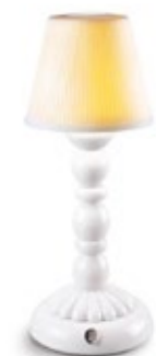
Palm Firefly lamp (white) 01023762