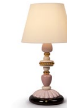
Firefly Table Lamp 01023995 CE 01023996 UK 01023997 US 01023998 JP