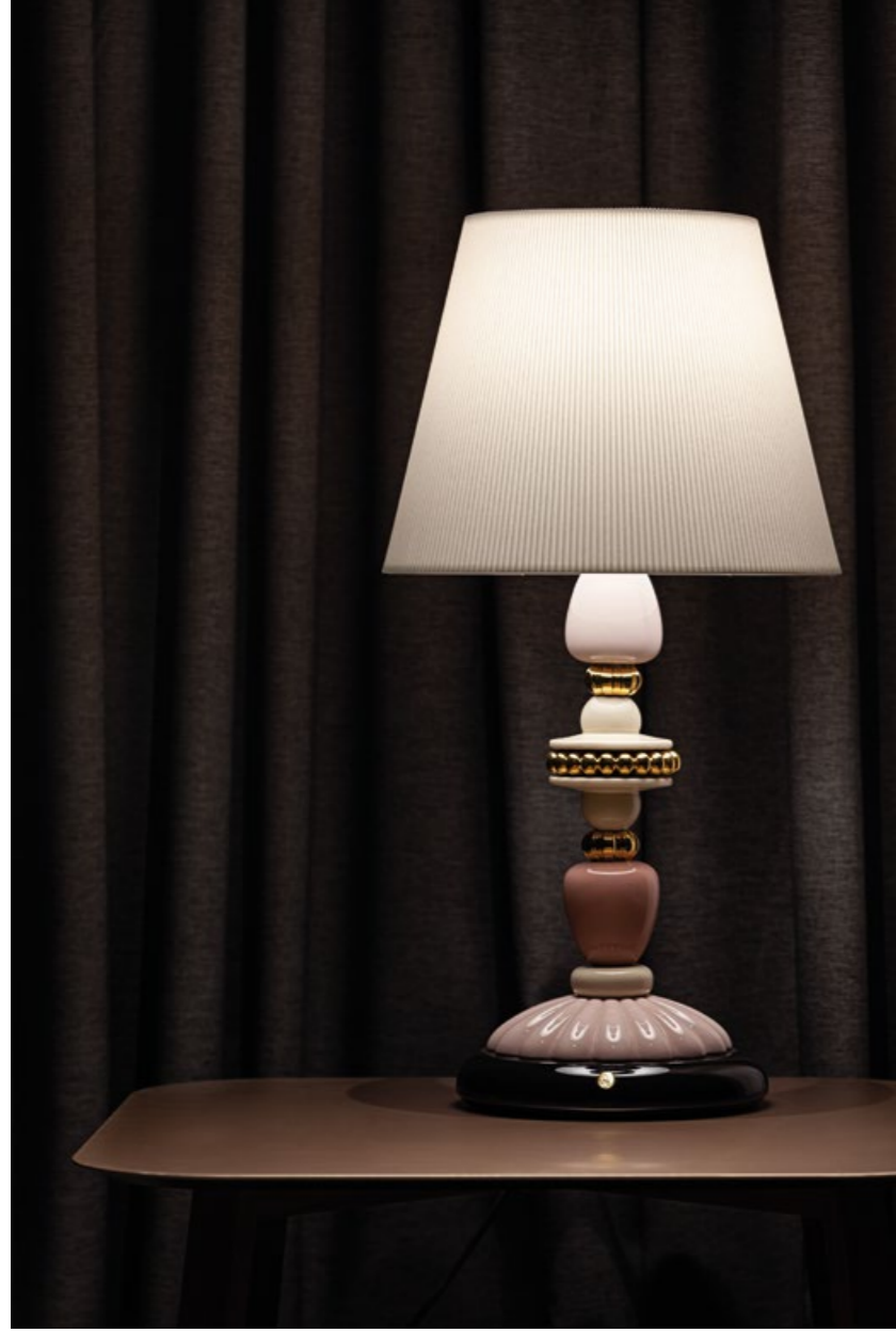
Firefly Table Lamp.