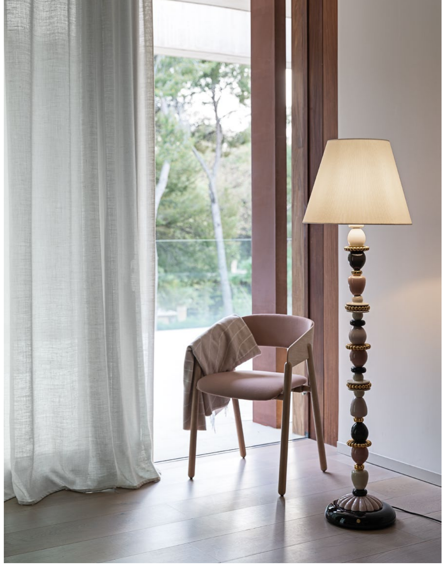
Firefly Floor Lamp.