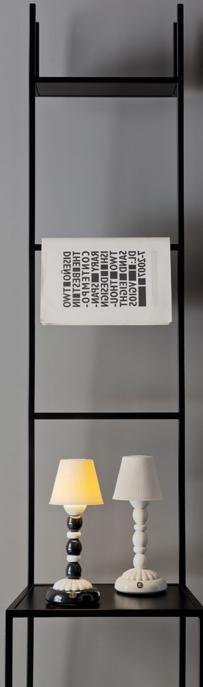
Palm Black & White - Palm White.