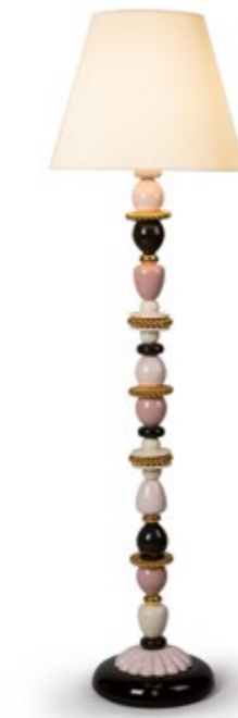
Firefly Floor Lamp 01024002 CE 01024003 UK 01024004 US 01024005 JP