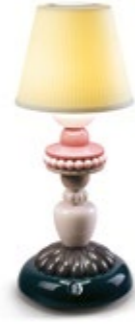
Sunflower Firefly lamp (black) 01023922