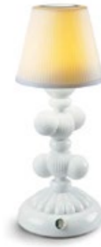
Cactus Firefly lamp (white) 01023765