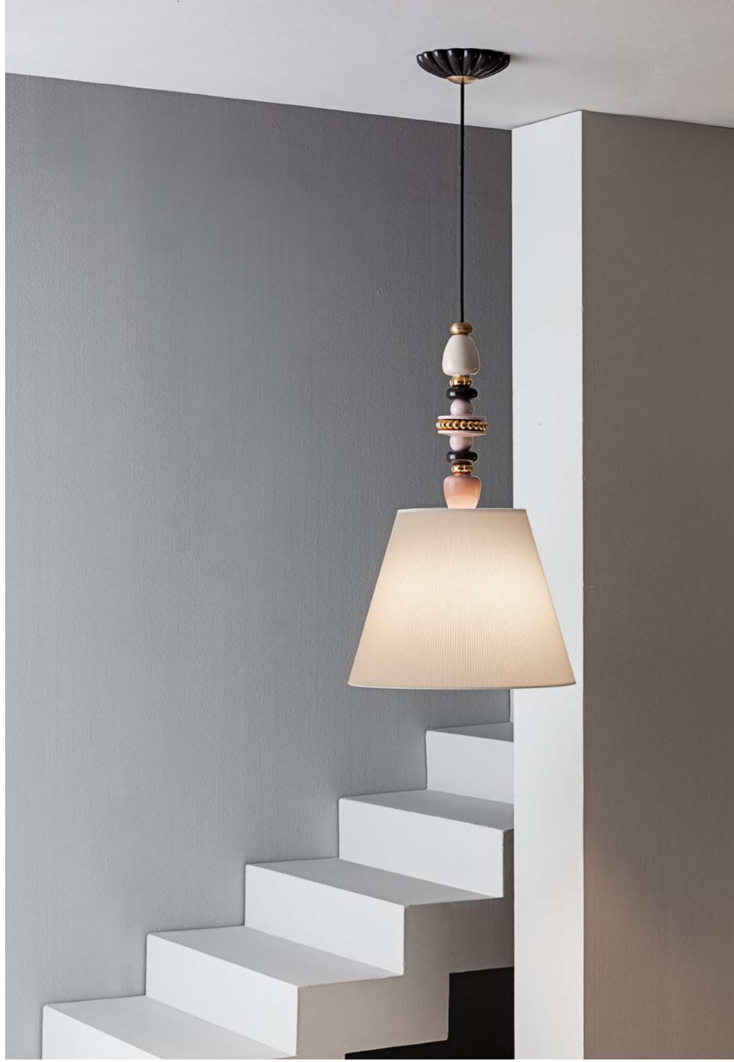
Firefly Hanging Lamp.