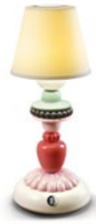
Sunflower Firefly lamp (ivory) 01023921