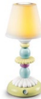
Lotus Firefly lamp (green blue) 01023761