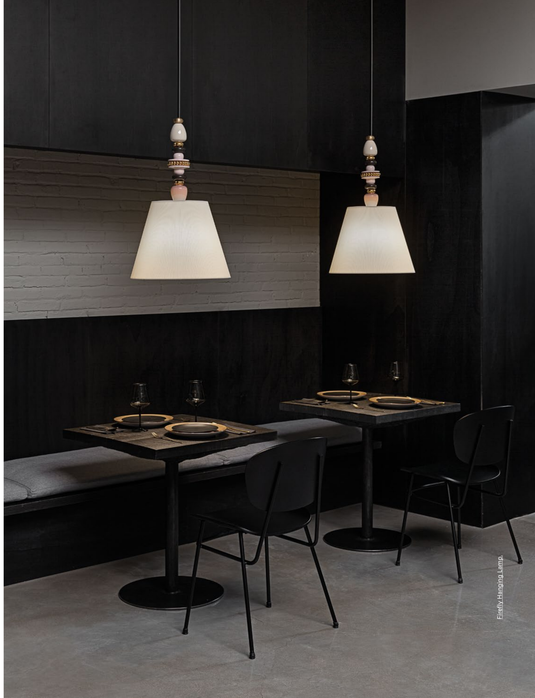
Firefly Hanging Lamp.