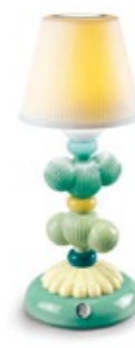
Cactus Firefly (lamp green) 01023766