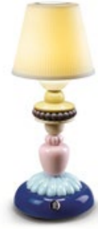
Sunflower Firefly lamp (blue) 01023920