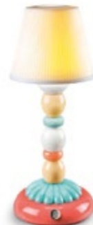
Palm Firefly lamp (pale blue) 01023764