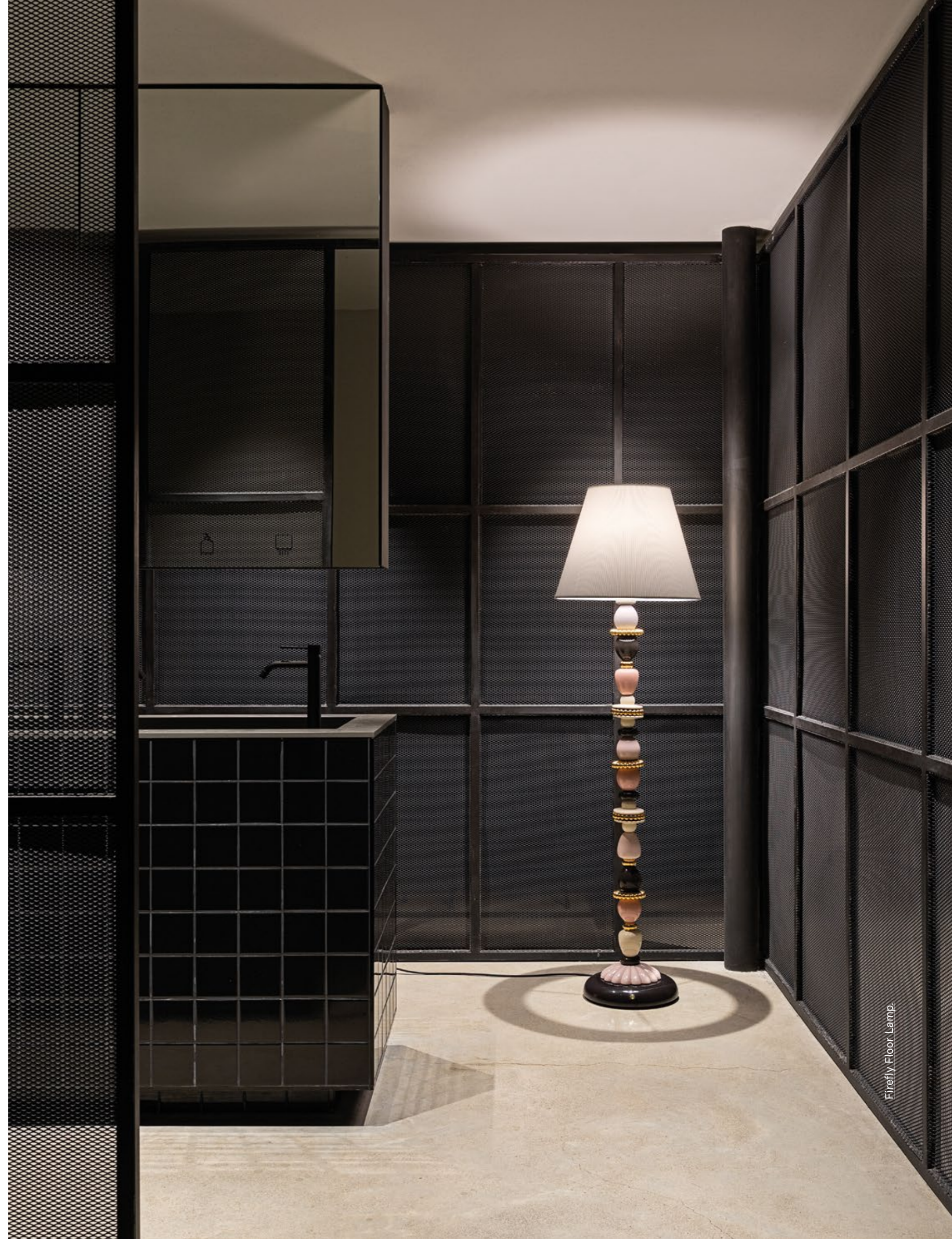
Firefly Floor Lamp.