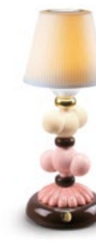
Cactus Firefly lamp (golden fall) 01023794