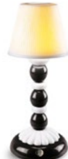
Palm Firefly lamp (black & white) 01023763