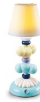
Cactus Firefly (lamp yellow & blue) 01023767