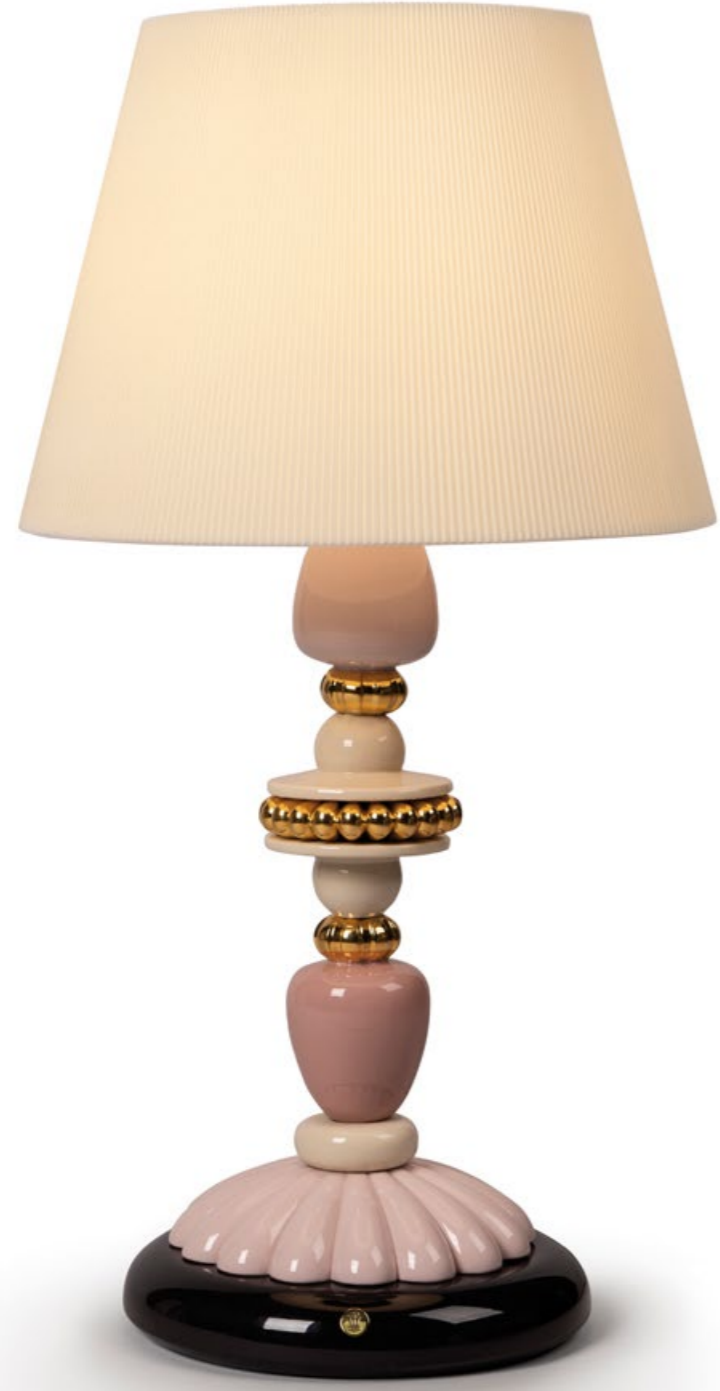
Firefly Table Lamp.